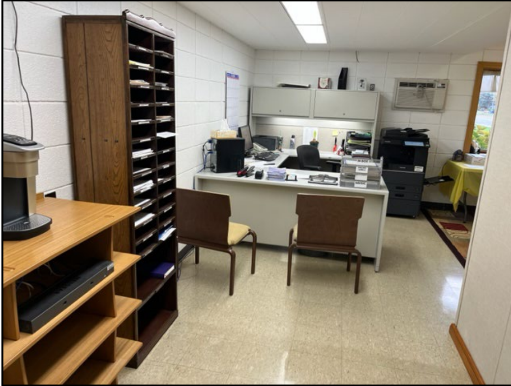
KATHY'S NEW OFFICE AS YOU ENTER