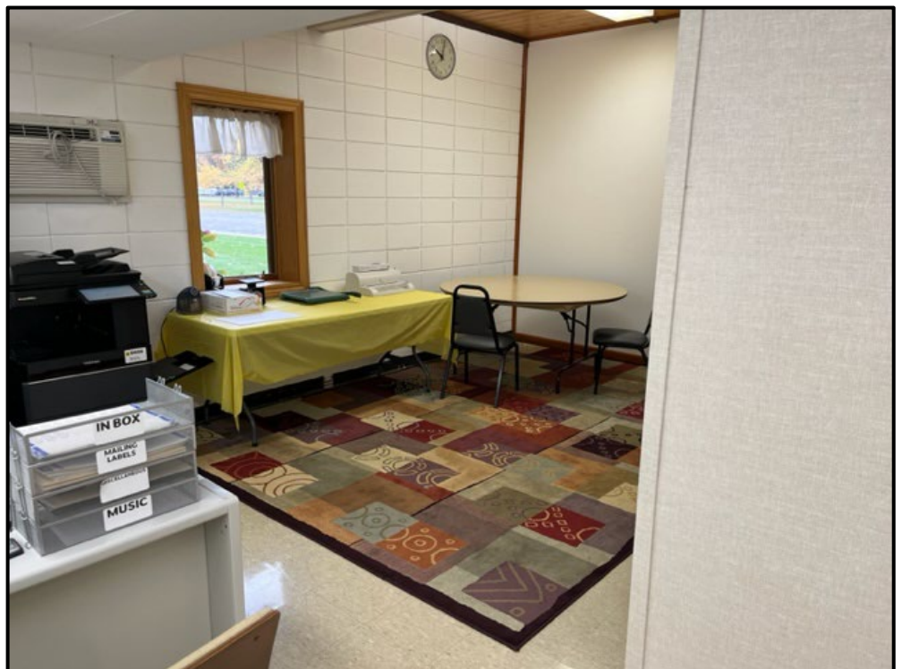
THE OTHER SIDE OF KATHY'S NEW OFFICE